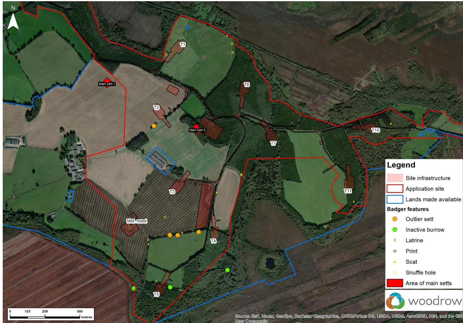
Figure A5.8.1: Badger activity for proposed wind farm